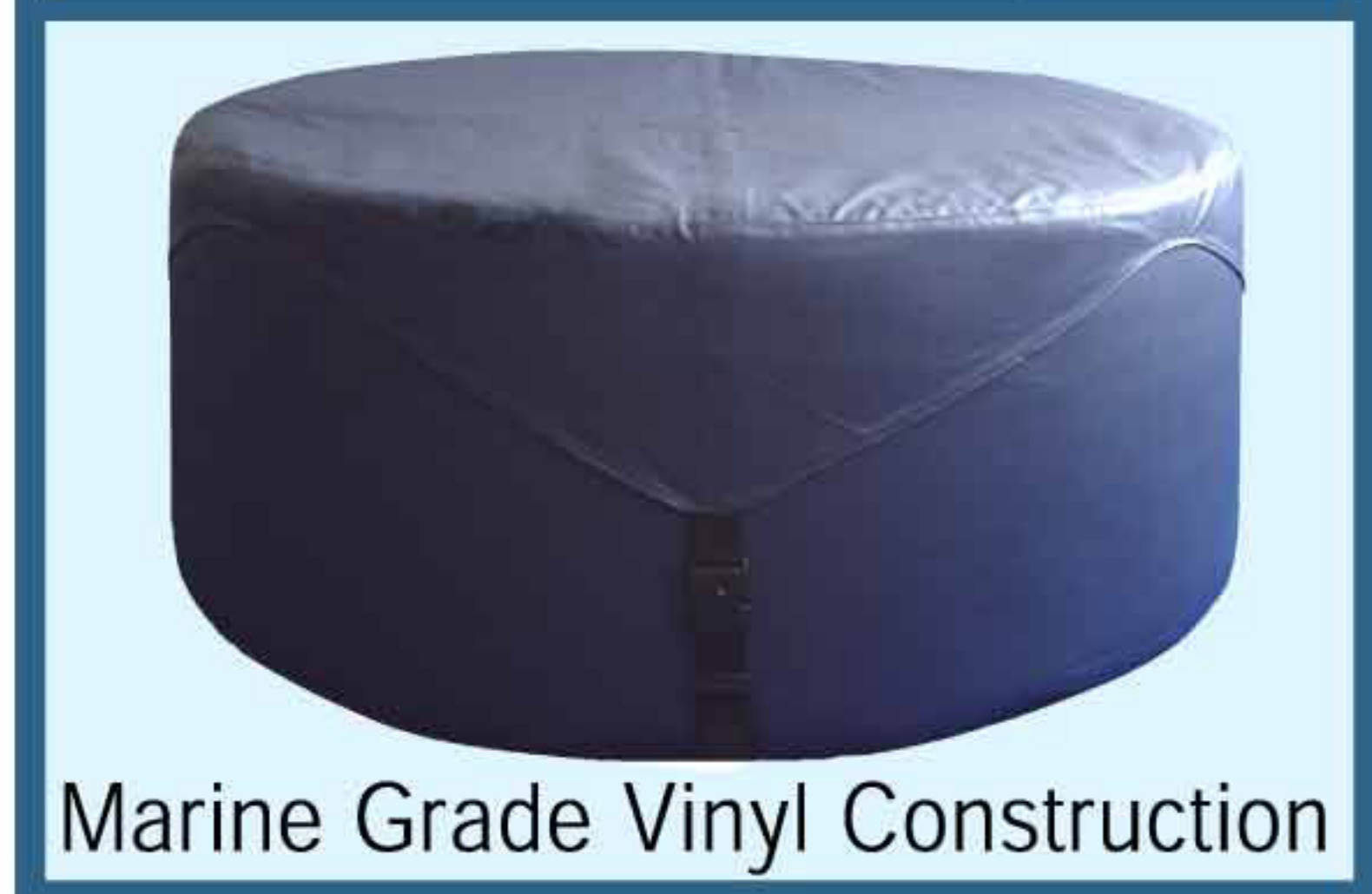
Marine Grade Vinyl Construction